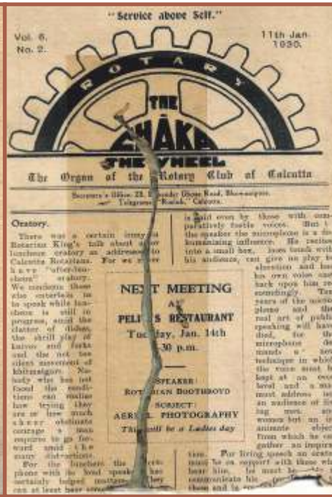
The Oldest Chaka